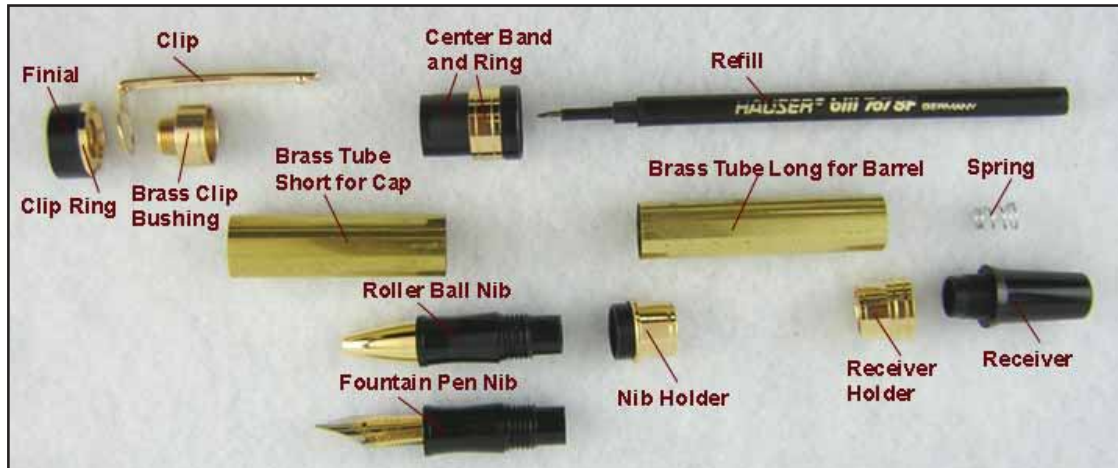
Parts Diagram for the El Grande Rollerball and Fountain Pen

Requires large-diameter "B" mandrel, el grande pen bushings (88K78.75), \frac{31}{64} " and \frac{33}{64} " drill bits, and minimum \frac{3}{4} " square blank.